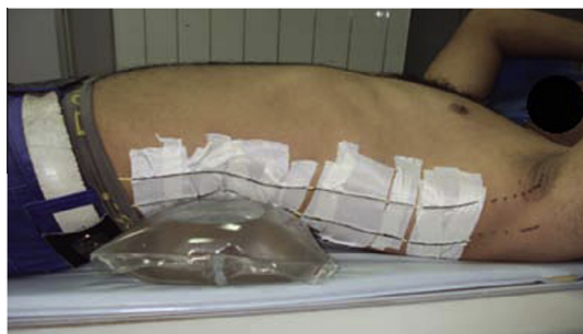
Figure 3 A water bag was placed under the lower part of the abdomen.

the skin, helped in choosing the best site of skin entry in relation to the stones (from the posterior axillary line or mid-axillary line, or in between). All these data helped in the preoperative planning for selecting the most accurate and safest access site for PCNL (Fig. 4).