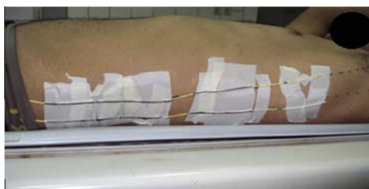
Figure 2 Two ureteric catheters were fixed on both axillary lines.