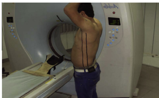
Figure 1 The two lines drawn on the patient represent the mid- and posterior axillary lines.